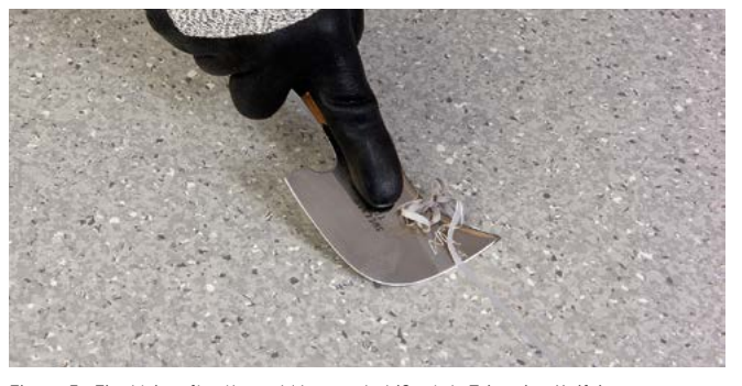
Figure 5a Final trim after the weld has cooled (Spatula Trimming Knife)

Wait at least 10 minutes for the remaining weld to cool to room temperature, the excess weld should be trimmed using the trimming blade with the guide removed. Keep as shallow an angle as possible between blade and floor to avoid the risk of damaging the product (Fig 5a or 5b).