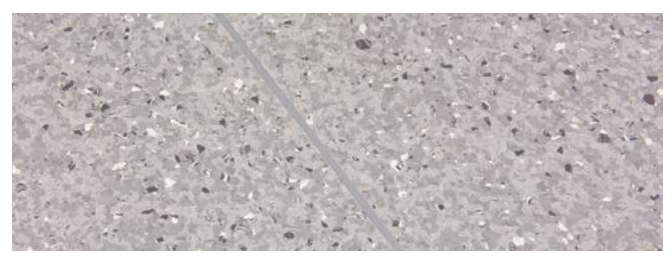
Figure 6 Final weld

Should a glazed finish be required this can be achieved with the nozzle attachment removed but still on the same heat setting; play the standard gun nozzle over the trimmed weld. Repeat over the whole length of the weld, keeping the gun moving constantly to prevent burning.