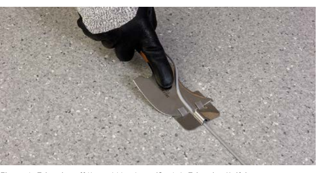
Figure 4a Trimming off the weld top layer (Spatula Trimming Knife)