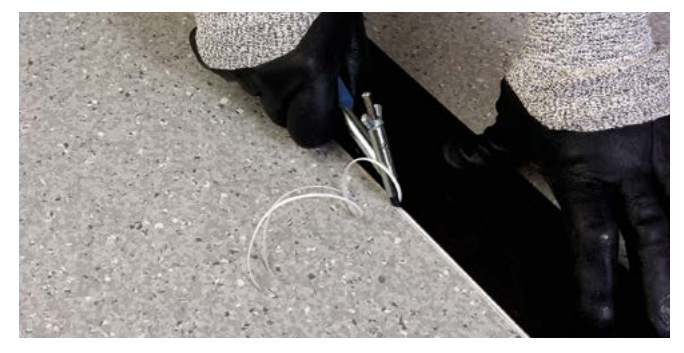
Figure 1 Grooving the seam

FOAM BACKED The groove on foam backed ranges such as Acoustic and Sports flooring should only be cut in the vinyl wear layer; NOT cut through to the PVC foam backing.