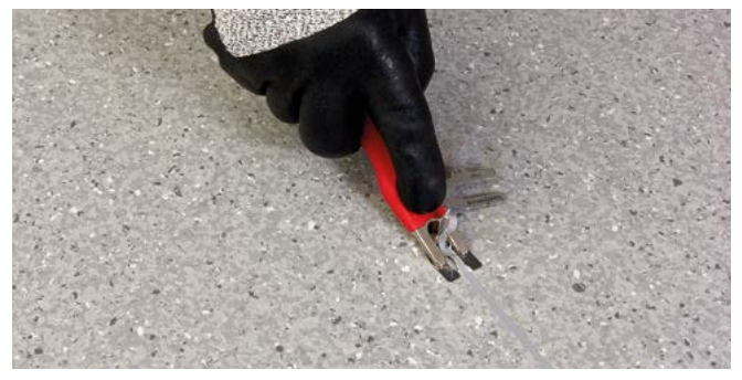
Figure 5b Final trim after the weld has cooled (Mozart Trimming Tool)