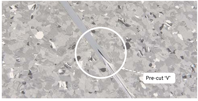
Figure 3 Weld joins

the centre. At this stage, pull the gun away from the groove and cut off the welding rod. Using a trimming tool and guide trim off the excess welding rod. Commence welding as before, from the opposite end of the room. Run out the weld into the pre-cut 'V' (Fig 3) and cut off the excess welding rod.