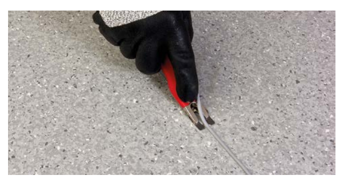
Figure 4b Trimming off the weld top layer (Mozart Trimming Tool)

KEY POINT Polyflor foam backed vinyl sheet flooring is liable to compression and sometimes, even after the final trim, the weld is proud of the floor. In this case using a Mozart trimming tool in preference to a traditional spatula is advisable.